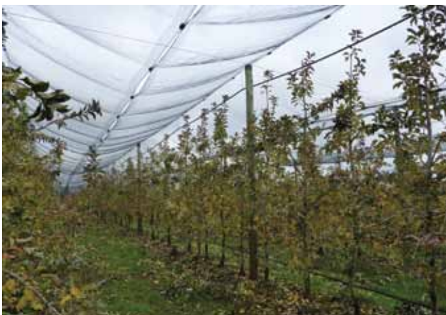
Black retractable shade netting (extended).

There is great variety in the types of netting and in the types and designs of supporting structures. The most basic form of netting is draped directly over the tree canopy or over a simple frame to form a tunnel along each tree row. Normally, draped or tunnel netting is placed over trees or vines for only the period that the fruit is ripening, as a protection against