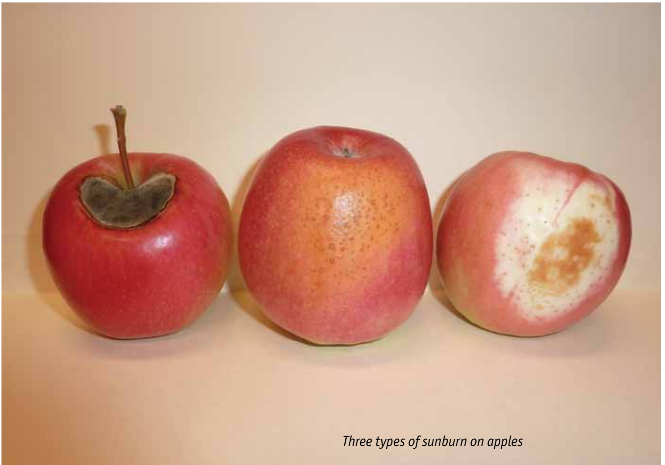
Three types of sunburn on apples