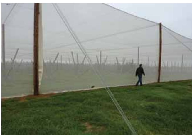
White permanent shade netting with enclosed sides to exclude birds.

Bees do not work as well under shade netting. It is advisable to introduce bee hives under the netted orchard during the blossom period and to allow some space between the top of the trees and the netting so that bees can fly freely along the tree rows.