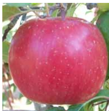
Fuji apple with three applications of wax-based sun protection.

Results from this product in northern Victoria have been variable, depending on how it has been used (see Case Studies at the end of this manual).