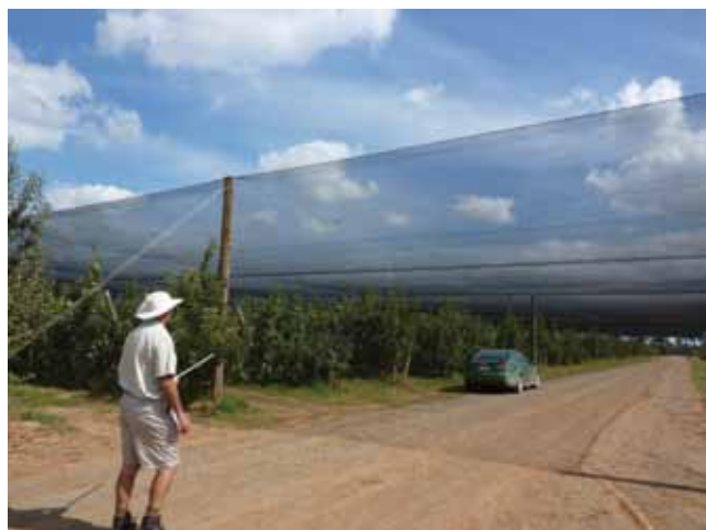
Black permanent shade netting with open sides over Granny Smith apples.

Netting is used around the world over a variety of crops, ranging from fruit and vegetables to nursery and speciality plants for sun, hail, wind and bird protection. In Australia, netting has been used mainly for bird or hail protection. It is becoming more common to see netting being installed in northern Victoria primarily for sun protection.