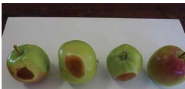
Sundowner apples 3 days after a 40°C day in December 2010