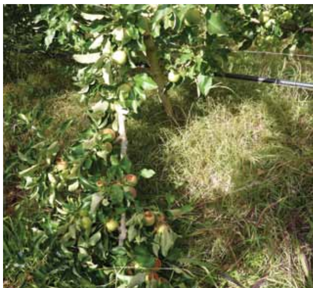
Sunburn damage on Sundowner apples, three days after sudden limb movement.