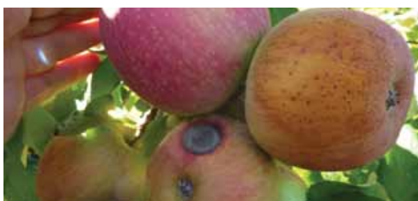
Sunburn on Sundowner apples (early April 2011)