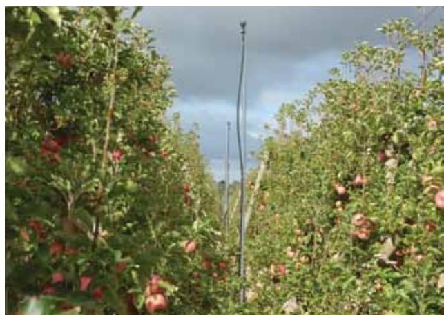
Over-tree sprinkler cooling system, with tall risers.