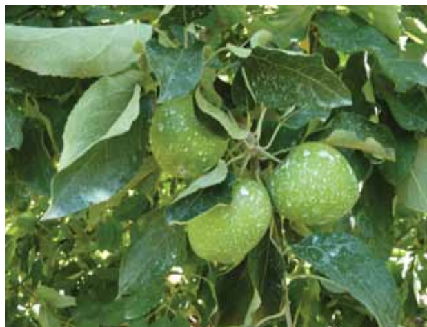
Clay-based spray-on sun protection.

Some independent scientific reports indicate these products can act like an insect repellent in fruit crops (Glenn & Puterka 2005). They have been used as a general preventative spray to reduce the amount of conventional spraying. It is assumed some insect pests find treated fruit unpleasant or they have greater difficulty finding the host.