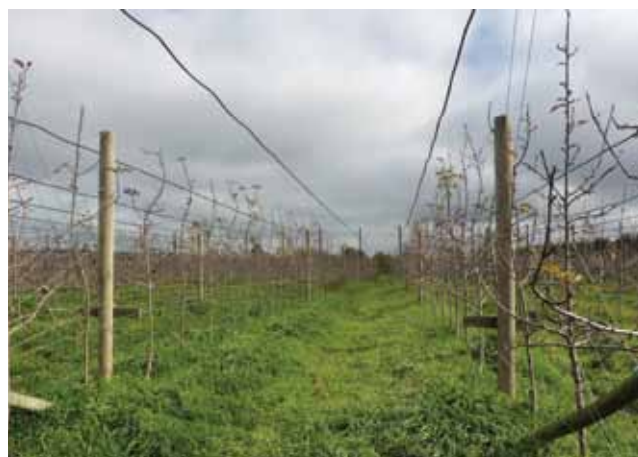
Over-tree sprinkler cooling system, with water delivery pipes attached to tensioned wires.