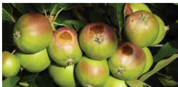
Early sunburn on young Sundowner apples (early December 2010)

Also, the manual focuses mainly on sunburn in fruit, which is the obvious visible symptom of an excessively warm climate. During the hottest part of the day, when air temperatures rise above 30 to 35°C, fruit tree photosynthesis is likely to slow, causing general heat stress, which will reduce potential fruit yield. This manual will not deal with this in detail, but we can expect that sunburn control options will also have some general yield benefits due to reductions in general heat stress on trees.