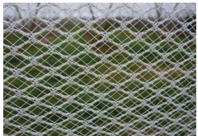
White 'quad' netting

Permanent shade netting may cause excessive shading in low sunlight intensity periods during spring that could potentially promote excessive shoot length, delay the onset of flowering and reduce fruit set. To avoid these problems,