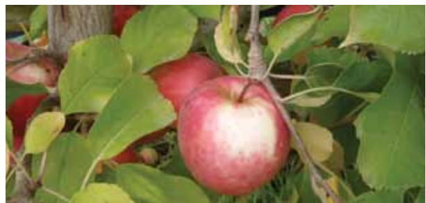
Photo-oxidative bleaching on a Pink Lady apple 5 days after a front apple was removed for the first colour pick, early May 2011

Even a small amount of yellowing or browning caused by sunlight can limit a fruit grower's markets. For example, hot weather and direct sunlight can cause Granny Smith and other varieties of green skinned apples to become slightly yellow or red. This can lead to very costly downgrading of the fruit when the market is demanding bright green apples. It is not unusual to have 30 per cent of a Granny Smith crop rejected for sun 'yellowing' (van den Ende 2004).