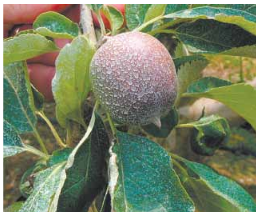
Calcium carbonate-based spray-on sun protection.

These products have been developed more recently and there is less objective information on their overall performance. Results from these products in northern Victoria have been variable, depending on how they have been used (see Case Studies at the end of this manual).