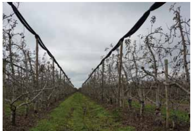
Black retractable shade netting (retracted)

The most common type of netting structure is designed and built from treated pine poles and tensioned cables. The net covering can be either flat or gabled, depending on the design of each structure. Flat-topped structures are designed to stretch under a build up of hail, while some of the gabled structures are designed to allow hail to open up gaps that will allow a build up of hail to fall through the valley of the gable. The supporting structure should be designed to withstand strong winds with cables attached to solid anchored foundations. Professional advice is available for design and installation of netting (Rigden, 2008). Design and construction of shade netting is a specialised field of work and should usually be done by professional service providers or under their close supervision.